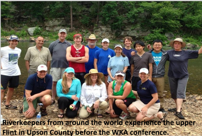
Riverkeepers from around the world experience the upper Flint in Upson County before the WKA conference.

Sweetwater Brewery partnered with Southeast