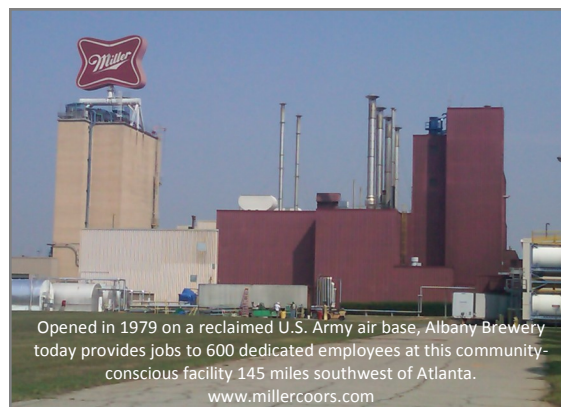
Opened in 1979 on a reclaimed U.S. Army air base, Albany Brewery today provides jobs to 600 dedicated employees at this community-conscious facility 145 miles southwest of Atlanta. www.millercoors.com