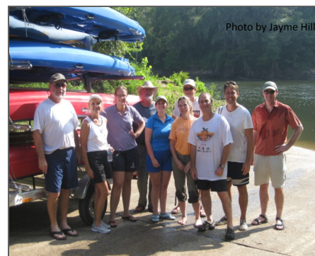
Pictured: Members of the 2010 Institute for Georgia Environmental Leadership class paddled the Flint through downtown Albany in July on the charter trip for the FRK's boat fleet.

Family River trips, please contact the office at 229.435.2241.